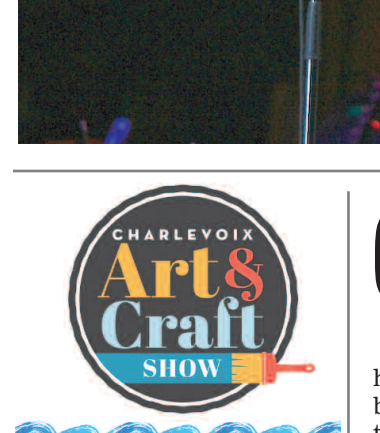
BRIDGE STREET BOAT SHOW

There's something for everyone to find as a variety of talented artists and craftsmen will join together at the 51st Annual Art & Craft Show taking place in East Park in downtown Charlevoix July 13 and 14.