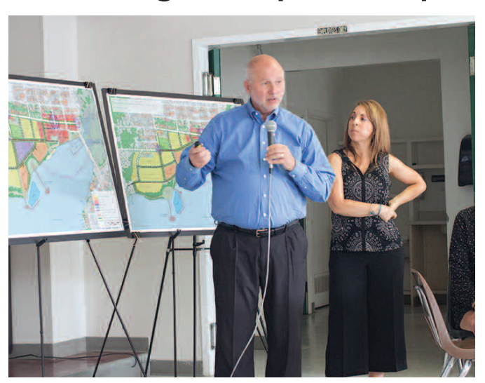
Beckett & Raeder's suggestions were made after gathering public input which will help guide the City's master plan update.