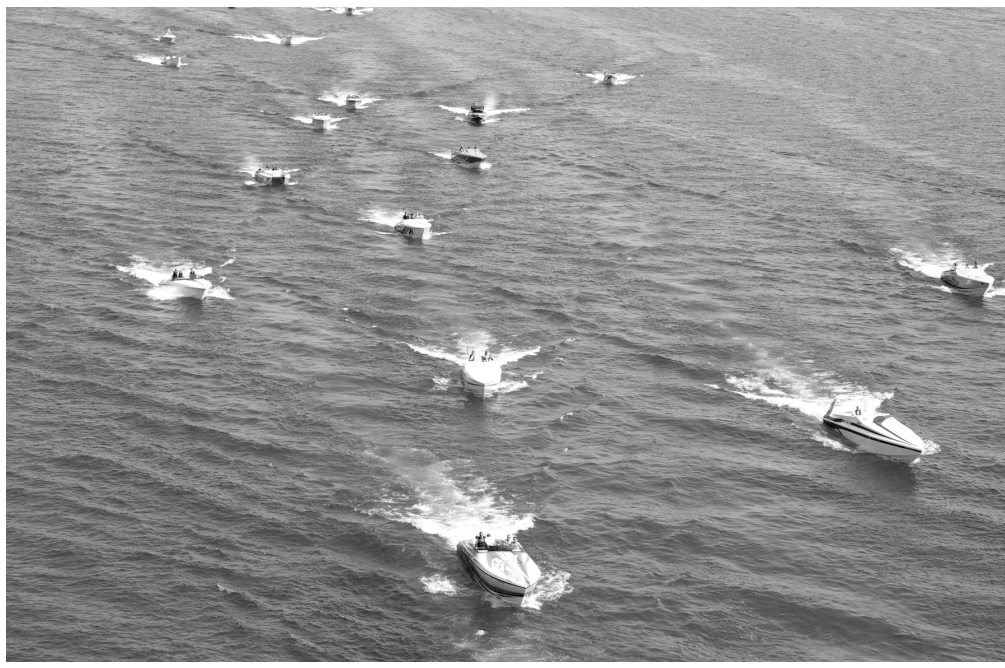
Bigger than ever, the 16th annual Boyne Thunder Poker Run brings speed, thunder, and excitement to Northern Michigan on July 12 and 13 in Boyne City.

Downtown Boyne City celebrates the Boyne Thunder Poker Run beginning Friday evening from 6 – 9:30pm with "Stroll the Streets," a street party with a collage of music, entertainment, dining, shopping, boat displays, and a car show. Boyne City rolls out the welcome mat to