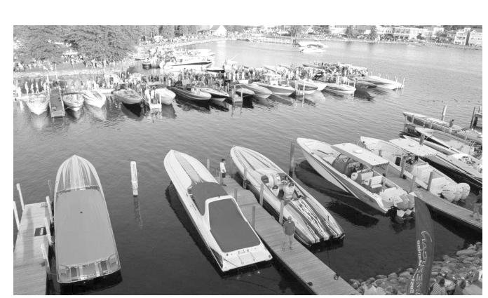
The poker run showcases over 100 high performance boats from all over the country, roaring through the waters of Lake Charlevoix and Lake Michigan on a 150-mile excursion in search of the best poker hand. Courtesy photo