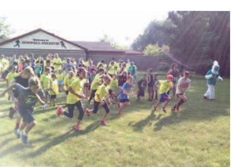
The Sweaty Yeti Run professionally timed race is a family friendly event in memory of two amazing women, sisters, who both lost their battles with cancer in 2014.