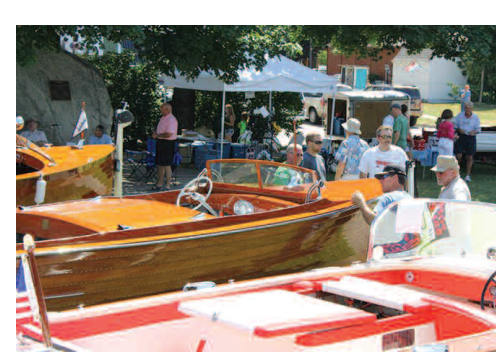
The South Arm of Lake Charlevoix and downtown East Jordan will be filled with classic boats and cars and a Micro Brew Beer Tent as the popular South Arm Classics takes place Sat., July 13 from 10am-3pm..

the car show event, states. "This is the 26th year for the car show in East Jordan. We are expecting over 100 cars for the show. Our pre-registrations are running well above last year. There will be a huge variety of vehicles at the show."